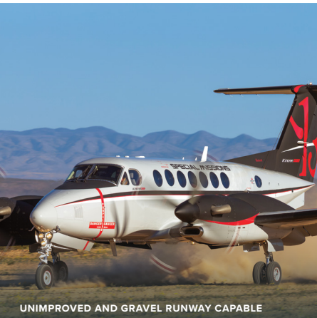
UNIMPROVED AND GRAVEL RUNWAY CAPABLE