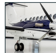
ER FUEL TANKS

*Performance data based on a standard conditions with zero wind. Range assumes long-range cruise at 10,000 ft and 45 minute reserves.