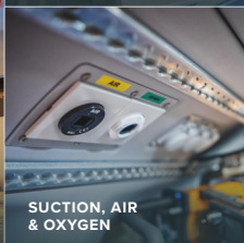
SUCTION, AIR & OXYGEN