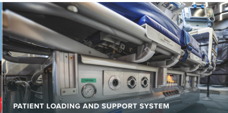
PATIENT LOADING AND SUPPORT SYSTEM